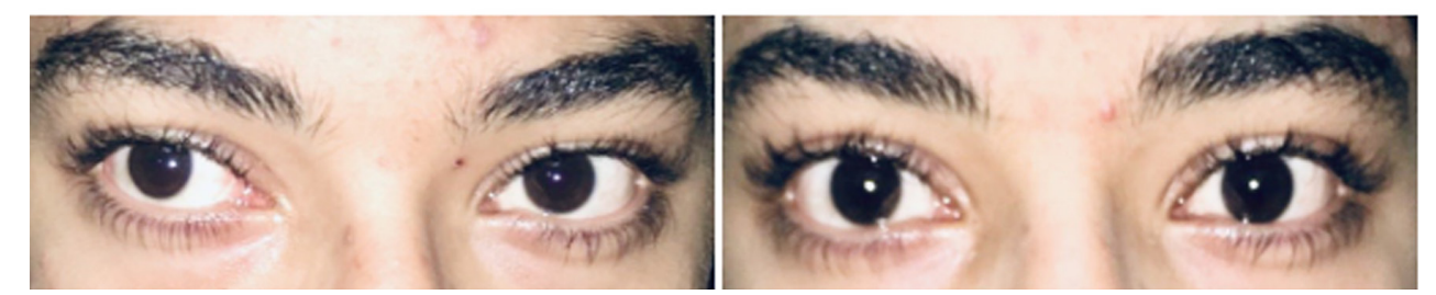
Figure 2. Pre-treatment (A) and post-treatment (B) strabismic eyes in the study group

Figure 1. Mean pre- and posttreatment near strabismus angle and far strabismus angle in the study and control groups